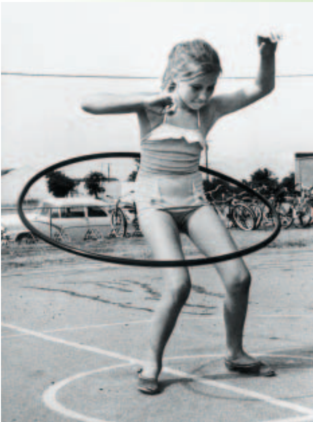
This young girl is playing with a Hula Hoop. The photo was taken in 1958.

During spring break, I went to Saskatoon with my parents and grandparents to visit my great-great aunt who lives in a seniors' residence. While we were there, we went to the Western Development Museum. The galleries about the Great Depression and the one on the years since 1940 got everyone talking. My grandparents do not remember the Great Depression, but they do remember the excitement of new things in the 1950s, like their first TV and a toy called the Hula Hoop. I began to wonder: