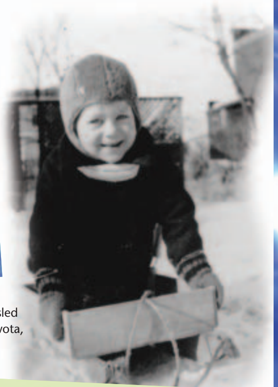
Child playing on sled in 1934 near Wawota, Saskatchewan

If there weren't enough players to form opposing teams, we had a game for which I cannot recall the English term (all of us spoke French). We called it... "jouer à la vache." Runs were only to first base and back to home plate.