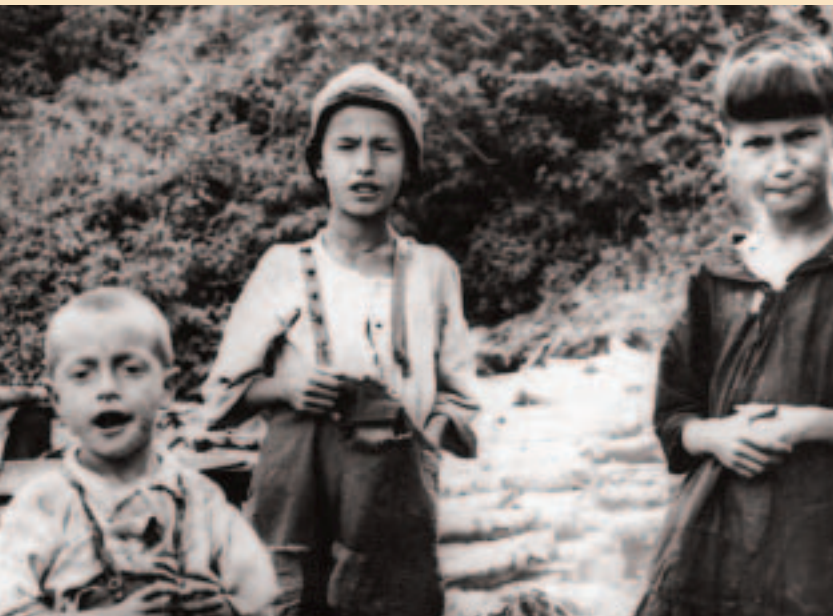
These children lived in Québec in the 1930s.