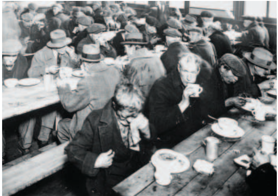
Homeless men lined up for meals of soup or stew at soup kitchens like this one in Edmonton. Soup kitchens were run by churches, charities, or city governments. Do similar places exist today? Why?

There was another group of people who suffered greatly during this time. Single men, or men without families, were not given relief in most Canadian cities if they could not find jobs. This meant that the men could not afford houses or apartments. They became homeless.