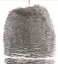
7. Left Forefinger