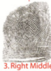
3. Right Middle