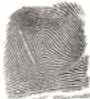
2. Right Forefinger