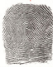
3. Right Middle