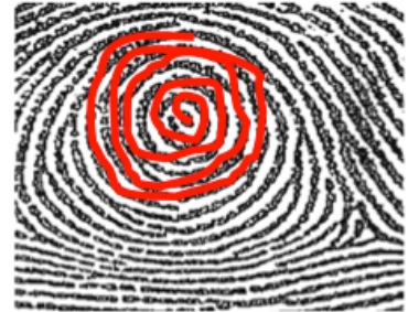
WHORL: Lines form a spiral – a bit like a whirlpool

- Whorls are found in 35% of the population