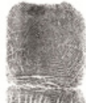
8. Left Middle