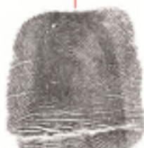
3. Right Middle