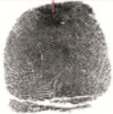
6. Left Thumb