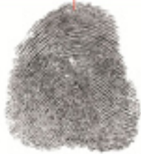
6. Left Thumb