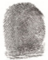
5. Right Little