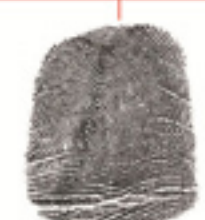
9. Left Ring