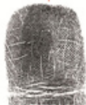
4. Right Ring