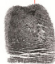
5. Right Little