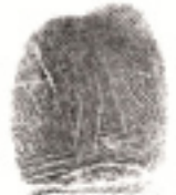
10. Left Little

PREPARED BY: CALGARY POLICE SERVICE IDENTIFICATION SECTION