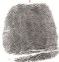
2. Right Forefinger