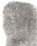
9. Left Ring