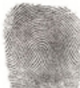
8. Left Middle