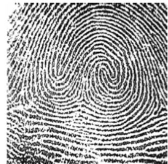
COMPOSITE: A mixture of two or more separate patterns