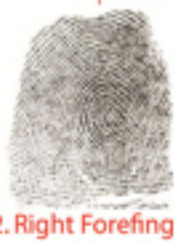
2. Right Forefinger