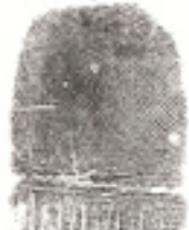
7. Left Forefinger