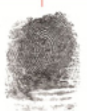
10. Left Little

PREPARED BY: CALGARY POLICE SERVICE IDENTIFICATION SECTION