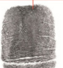
8. Left Middle