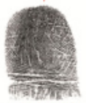
5. Right Little