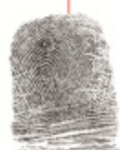
8. Left Middle