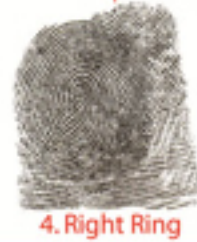
4. Right Ring