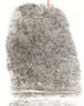
7. Left Forefinger