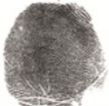
1. Right Thumb