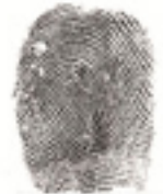
10. Left Little

PREPARED BY: CALGARY POLICE SERVICE IDENTIFICATION SECTION