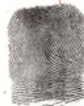
4. Right Ring