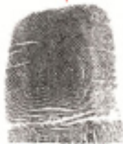
3. Right Middle