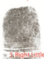
5. Right Little