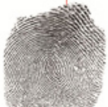
1. Right Thumb