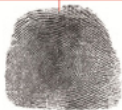
1. Right Thumb