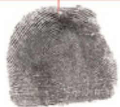
6. Left Thumb