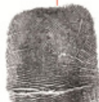
4. Right Ring