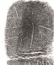
9. Left Ring