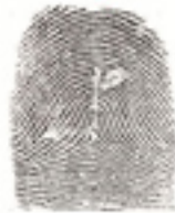
7. Left Forefinger