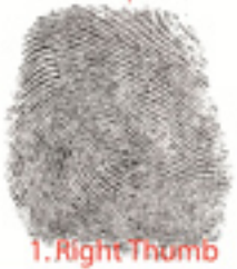
1. Right Thumb