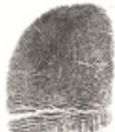
2. Right Forefinger